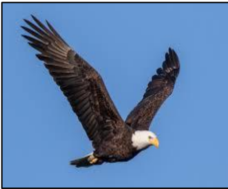
Eagle-high flying bird,