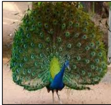
peacock- low flying bird, penguin -flightless bird.