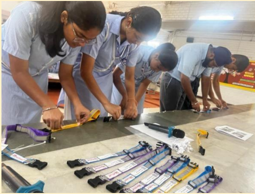
Students pasting stickers on the Reflective Tags for community dogs