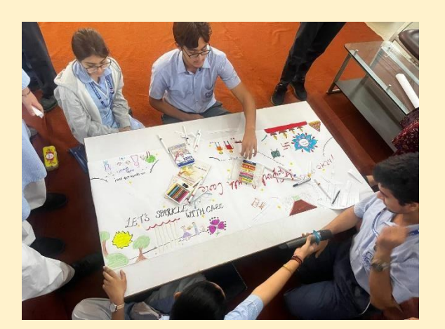
Students engaged in poster making activity