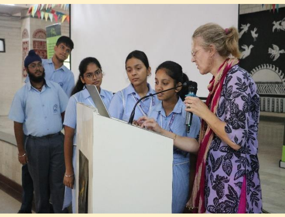
Students submitting the pledge